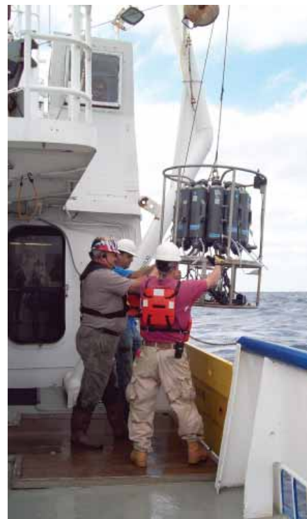
Deployment of SeaBird Carousel Water sampler equipped with twelve 5-liter Niskin bottles and a conductivity-temperature-depth (CTD) sensor.