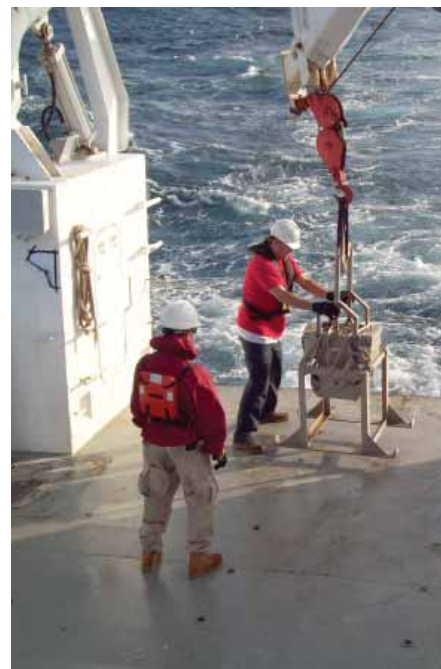
Recovery of box cores.