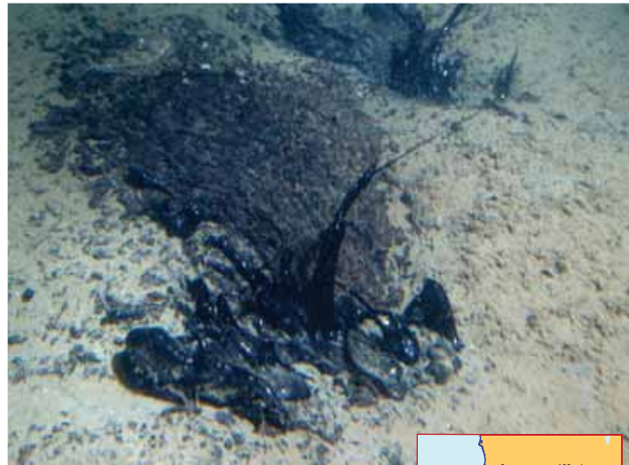
Natural tar seep offshore Gaviota in approximately 60-m water depth.

The chemical analysis by OSPR showed that the tar balls were not residues of the