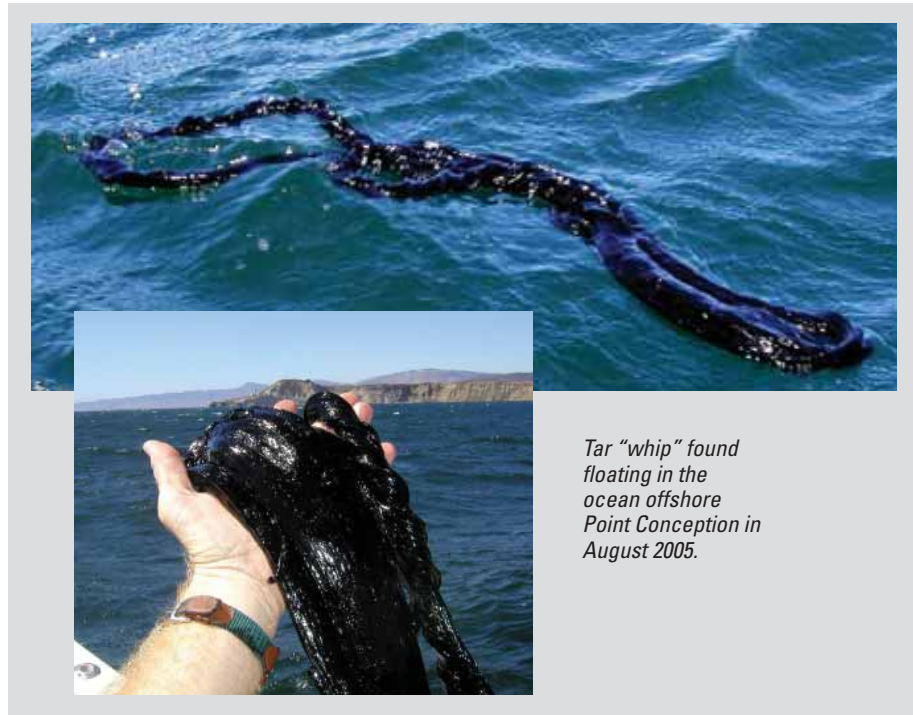
Tar “whip” found floating in the ocean offshore Point Conception in August 2005.