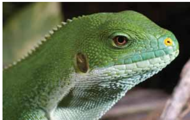
Brachylophus bulabula ; female on Kadavu Island, Fiji.