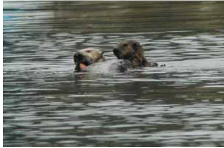
A sea-otter pup watches eagerly as its mother eats a fat innkeeper worm in Monterey Bay, California. Photograph by Tania Larson , USGS.

Kelp forests are often called the rainforest of the sea; they support wide varieties of marine life. Sea otters are both a sentinel and a keystone species for the health of kelp forests. Without sea otters to limit sea urchins and other herbivores, overgrazing drastically diminishes the kelp. Photograph by Tania Larson , USGS.