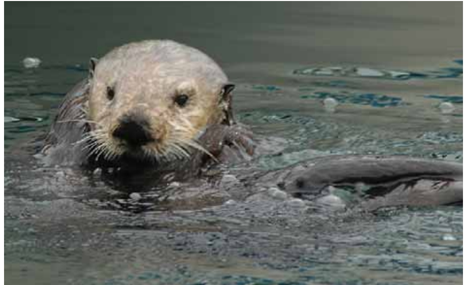
A sea otter swims in Monterey Bay, California. USGS scientists and their partners study sea otters in efforts to help the threatened species continue to recover from near extinction.