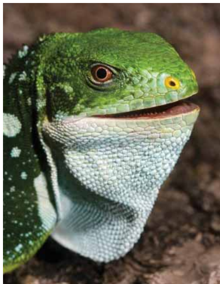
Brachylophus bulabula ; male in threat posture on Kadavu Island, Fiji.

“This island basin is currently under attack by a number of invasive species, such as the brown tree snake, various rat species, and the coqui frog, which tend to reduce biodiversity,” said Fisher . “Climate change may reduce coastal habitats and alter coastlines in the Pacific, further putting biodiversity at risk. A more accurate understanding of the patterns and processes that impact diversity in these unique island groups will help land man-