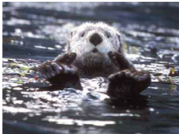
Sea otter.