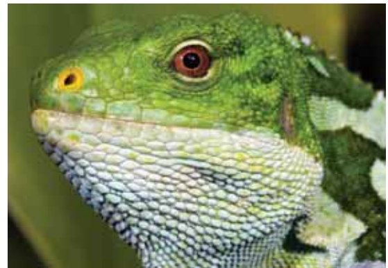
Newly discovered Pacific iguana Brachylophus bulabula ; male.