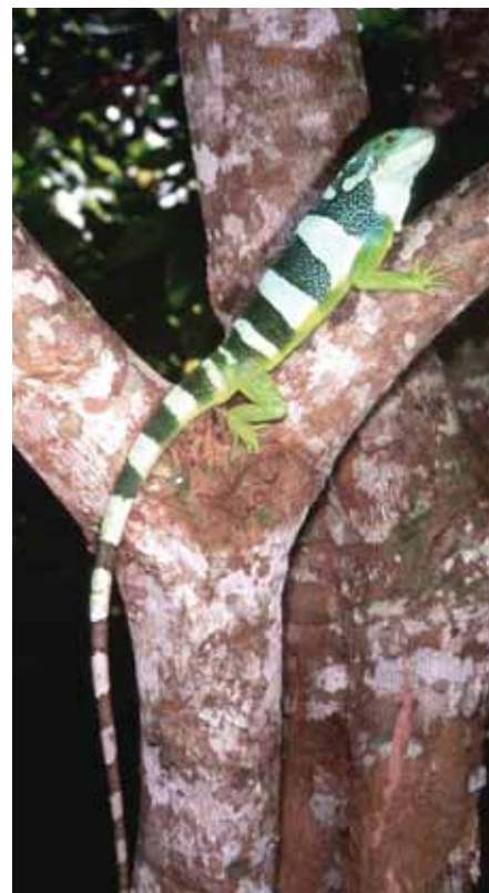
Brachylophus bulabula ; male on Ovalau Island, Fiji.

agers set appropriate goals for conservation of these resources.”