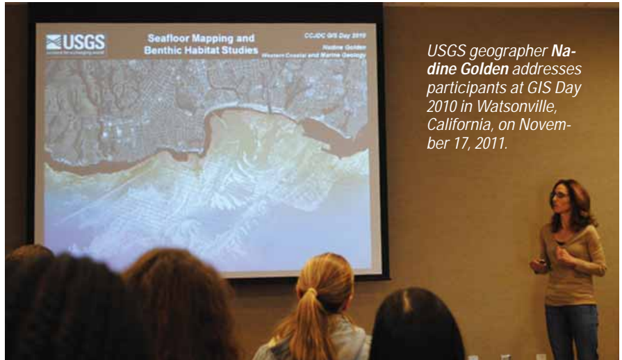
USGS geographer NADINE GOLDEN addresses participants at GIS Day 2010 in Watsonville, California, on November 17, 2011.

in usSEABED, a relational database of integrated quantitative and verbal data on seabed texture, composition, and geophysical properties ( http://walrus.wr.usgs.gov/usseabed/ ). As an example of how all these data types can be used together, Golden discussed the California Seafloor Mapping Program (CSMP), an interdisciplinary study that USGS scientists are leading to create a series of comprehensive coastal and marine geologic and habitat base maps for all of California's state waters ( http://walrus.wr.usgs.gov/mapping/csmpl/ ). *