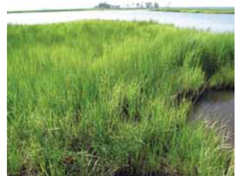
Coastal wetland on Maryland’s Eastern Shore—example of a disappearing marsh in the Mid-Atlantic U.S. Photograph taken in Blackwater National Wildlife Refuge, Maryland, by James Lynch , USGS.

( Disappearing Wetlands continued on page 5 )