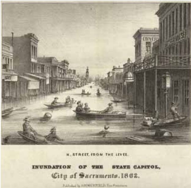
An extreme series of storms lasting 45 days struck California in late 1861-early 1862. They caused severe flooding that turned the Sacramento Valley into an inland sea, forced the State Capital to be moved from Sacramento to San Francisco for a time, and required Governor Leland Stanford to take a rowboat to his inauguration. (From http://urbanearth.usgs.gov/winter-storm/ .)