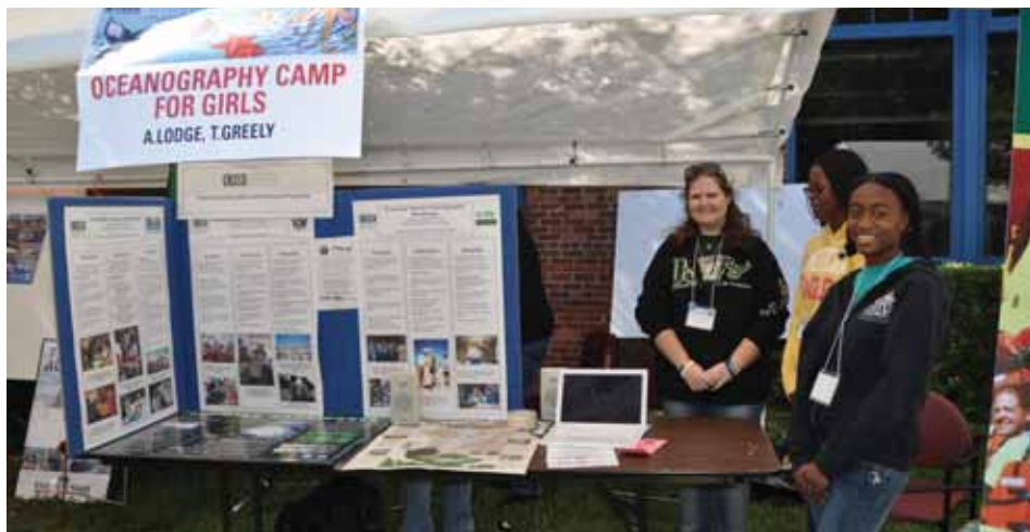
Graduates of the Oceanography Camp for Girls participate in the Open House by sharing information about the program and what it has done for their educational careers.

Each year, alumni from this program return to participate in the Open House, sharing with visitors how their experiences in the program continue to influence their college educations and career choices; the program is run by the University of South Florida College of Marine Science and receives USGS support. Every student who visited “Earth Science Day for Fourth Graders” received a goody bag full of information about scientific resources, including hands-on activity pages, reference materials, and Web links to in-depth resources online.