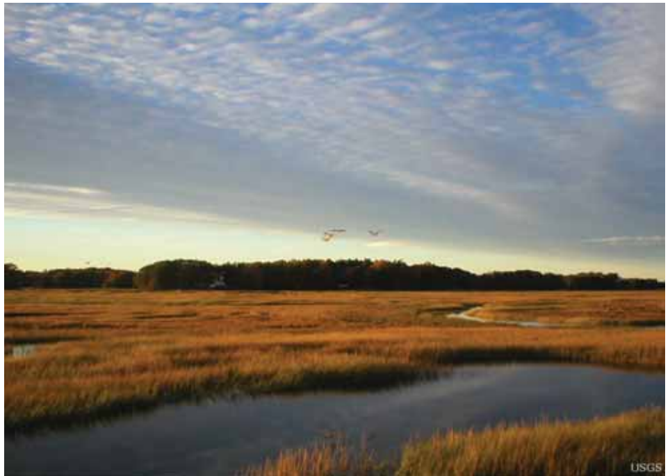
Tidal marshland in the Plum Island Estuary, Massachusetts. The marshes of Plum Island Estuary are among those predicted by scientists to submerge during the next century under conservative projections of sea-level rise.

Coastal wetlands provide critical services, such as absorbing energy from coastal storms, preserving shorelines, protecting human populations and infrastructure, supporting commercial seafood