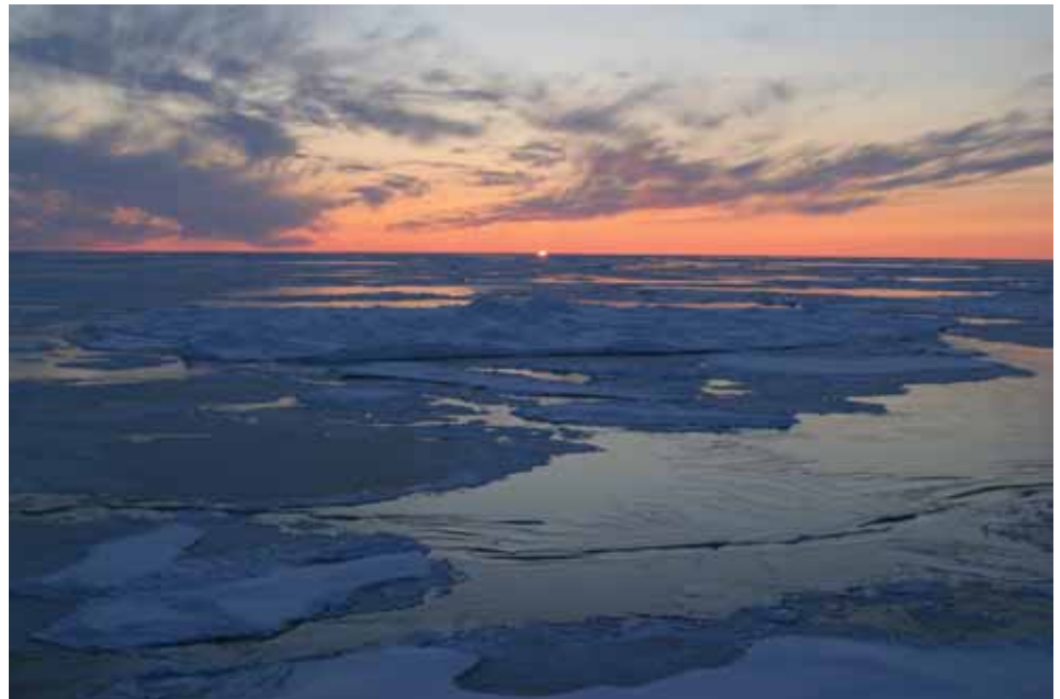
Sunset over sea ice on the Arctic Ocean, September 1, 2008.

( Polar Bear Habitat continued from page 1 )