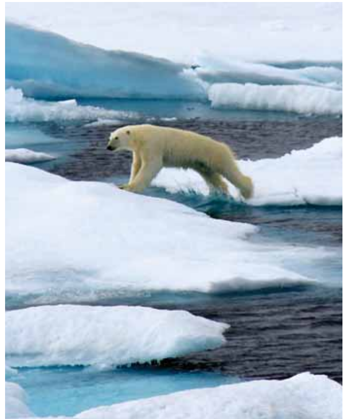
Polar bear leaps from one ice floe to another in the Beaufort Sea of the Arctic Ocean, August 9, 2010.