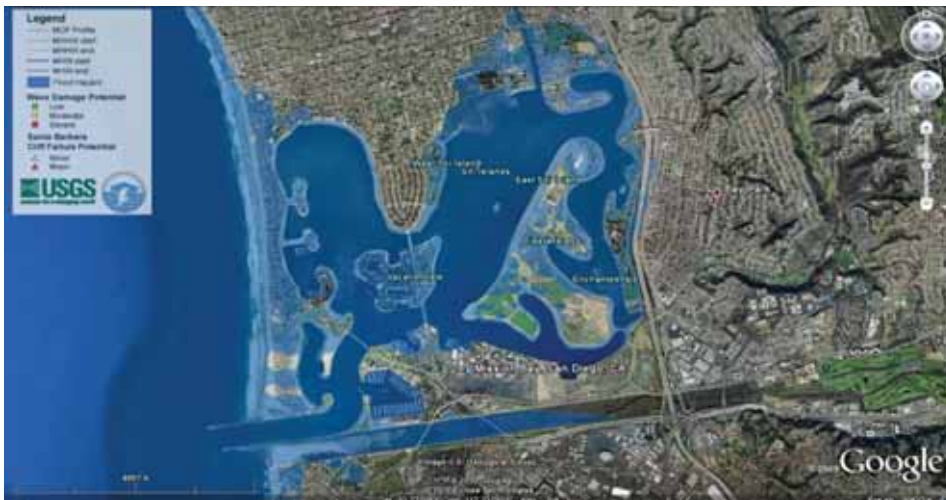
Estimated coastal inundation (blue shading) at Mission Bay in San Diego, California, using the Coastal Storm Modeling System (CoSMoS) developed for ARkStorm. (From USGS Open-File Report 2010-1312, http://pubs.usgs.gov/of/2010/1312/ )

Also available online is USGS Open-File Report 2010-1312, Overview of the ARkStorm Scenario , at http://pubs.usgs.gov/of/2010/1312/ . ❁